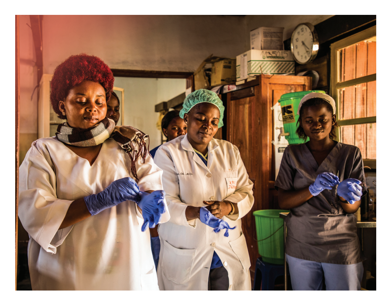
16 January 2019 - Beni, Democratic Republic of Congo. Health workers put their gloves on before checking patients at the hospital.

Exploring Results-Based Financing in South Sudan: Despite initial interest, after several discussions in-country and an opportunity to send a delegation to an in-depth training course on RBF, the senior leadership of the Ministry of Health expressed little interest in exploring the development of an RBF pilot in the country. As such government officials did not attend the RBF training course, which was a precursor to ensuring that the feasibility study and pilot design be developed with strong ownership by the MOH. As such activities related to RBF were not pursued further.